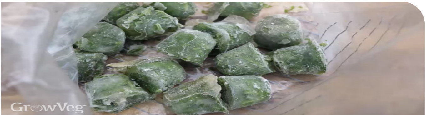
Top Tips for Freezing Garden Produce