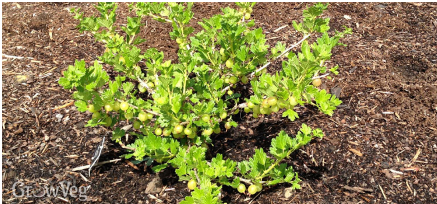
Mulch gooseberries to suppress weeds and feed the plant

(Please note that in a few areas of the United States growing gooseberries is prohibited because they can serve as a host to white pine blister rust, a disease devastating to the lumber industry. Check for local restrictions before sourcing plants.)