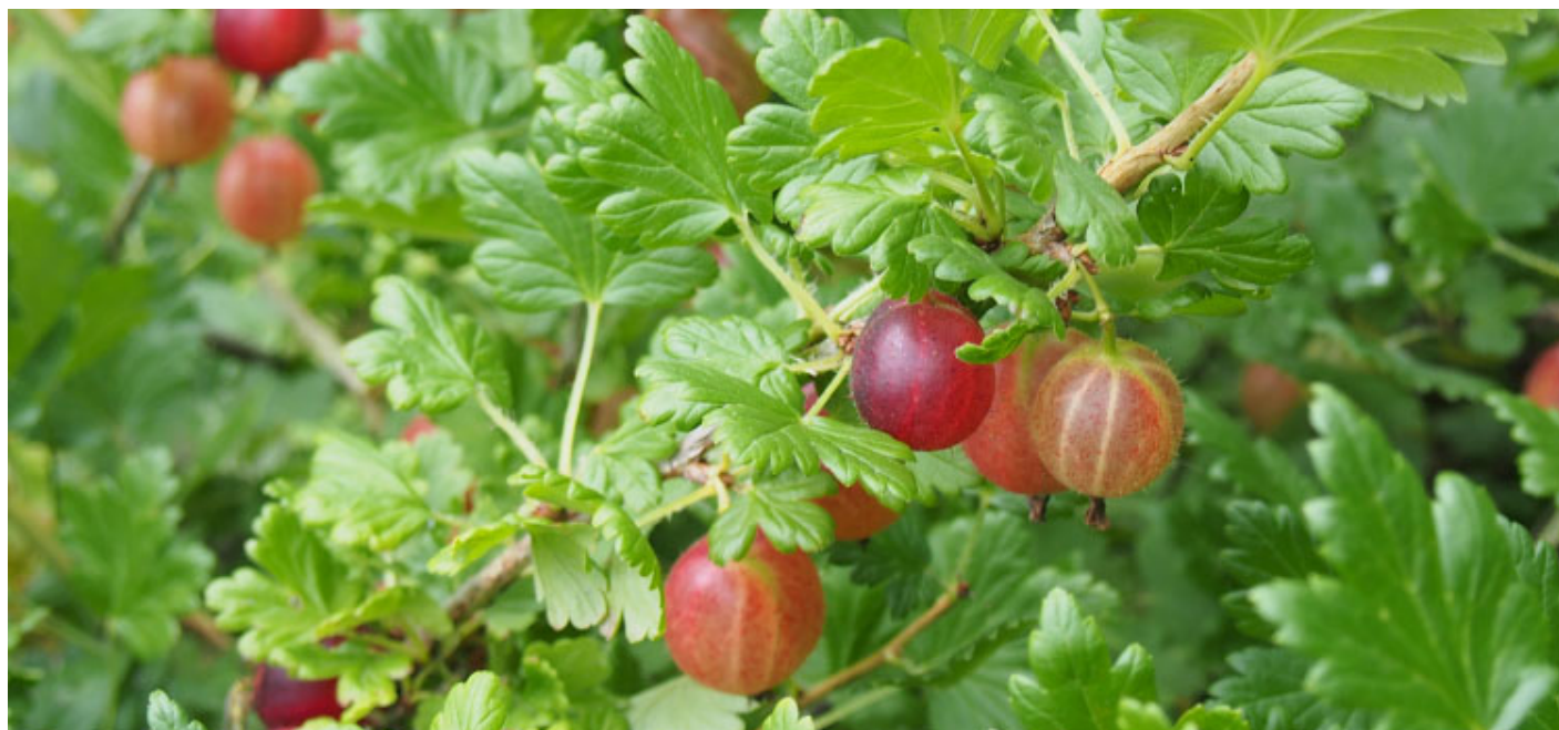
Red gooseberries are available as well as green and yellow varieties

The berries themselves are typically pale green, but look out for eye-catching red or yellow varieties too. Most plants are very thorny, but some varieties are easier on the hands with considerably fewer thorns.