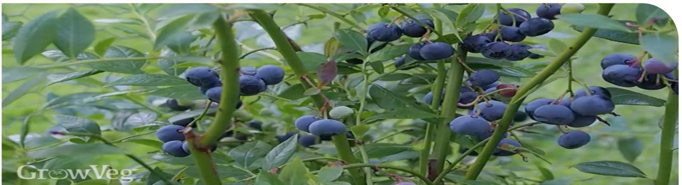
Growing Blueberries from Planting to Harvest