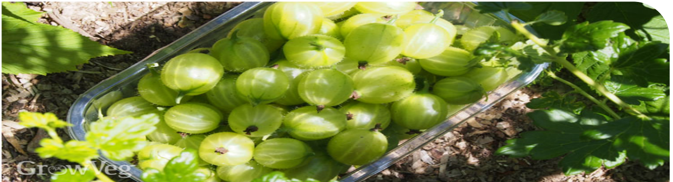
Growing Gooseberries for Delicious Drinks and Desserts