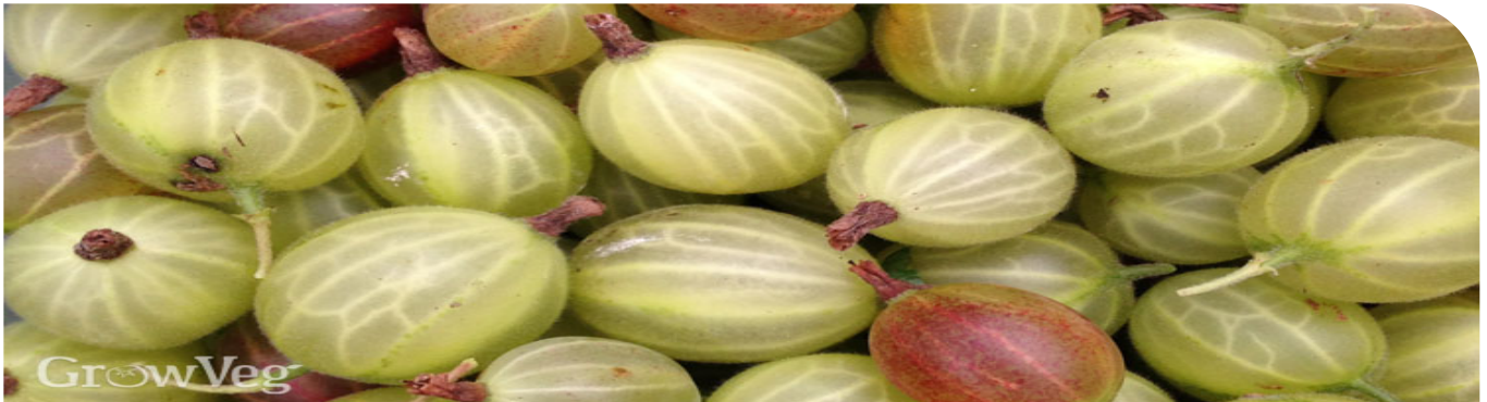
How to Grow Bigger Better Gooseberries