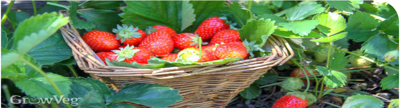
Growing Strawberries from Planting to Harvest