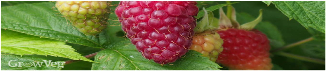
Growing Raspberries from Planting to Harvest