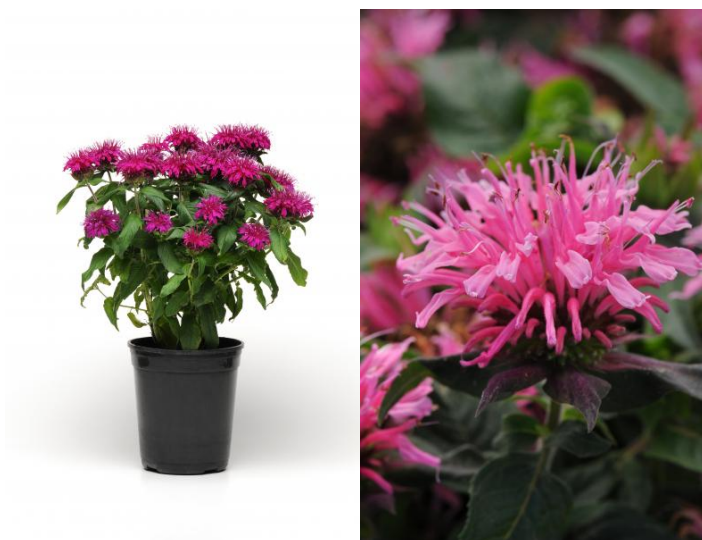
Balmy monarda are

after sticking to promote branching. The liners are usually ready to be shipped or transplanted at 28-35 days after sticking.