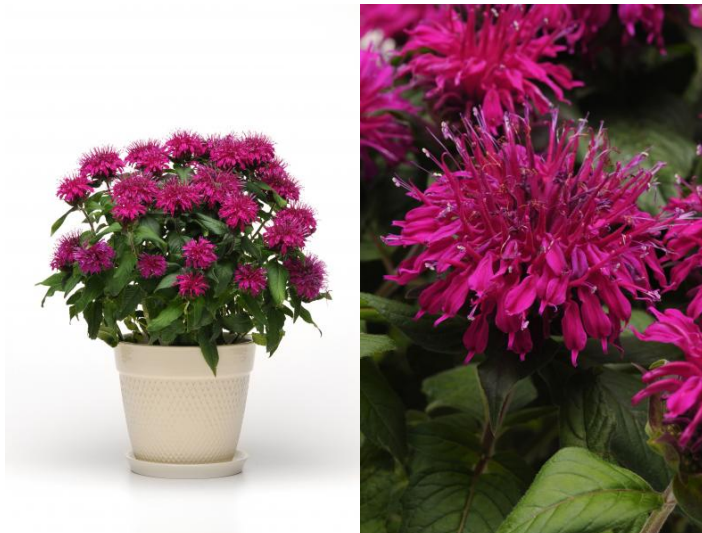
The Balmy series is

densities, height control is often not required. If the plants need to be toned, spray applications of 2,500-ppm daminozide (B-Nine or Dazide) are effective.