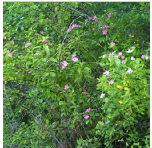
(/wildflowers/plant-of-the-week/images/newenglandaster/Symphotrichum_angliae_Photo1A_lg.jpg) Close up of leaves and stem (c) 2002 Steven J. Baskauf ( http://bioimages.vanderbilt.edu/contact/baskauf ).