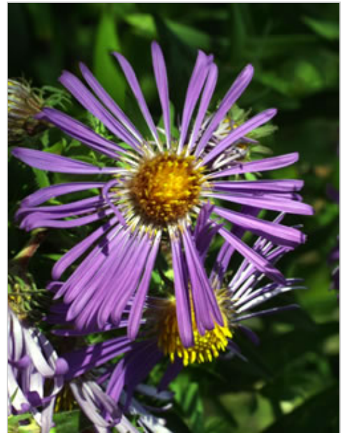
(/wildflowers/plant-of-the-week/images/newenglandaster/Symphotrichum_angliae_Photo2_lg.jpg) Close up of capitulum.